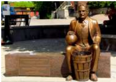
Statue of Naismith in Almonte